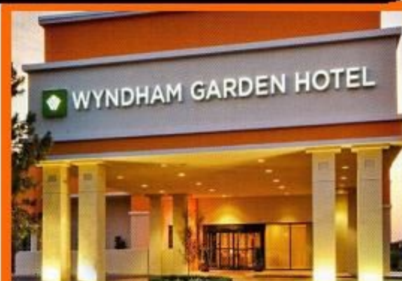
Wyndham Garden Hotel Oklahoma City Airport 2101 S Meridian Ave., Oklahoma City, OK 73108 1-800-622-7666