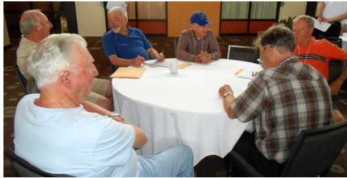
1st Reunion -1985, 30 Years

To all who can not make this reunion, we are sorry you can't join us for whatever reason and we will miss you! Your absence will be felt as the attendees gather in our short stay of togetherness and camaraderie. For those of you who are ill, we keep you in our thoughts for a quick recovery. To those attending, we look forward to seeing you once again!