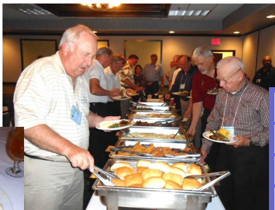
Pics from 2013 Reunion Banquet